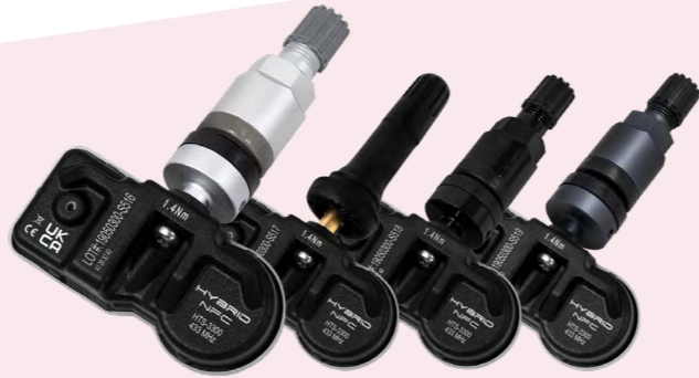
Silver Clamp-In: 72-21-945 Black Clamp-In: 72-21-947