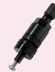
Black Clamp-In: 72-20-139