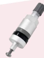
Silver Clamp-In: 72-20-138