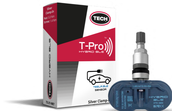
Silver Clamp-In: 72-21-987 Black Clamp-In: 72-21-989 Graphite Clamp-In: 72-21-990