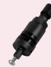
Graphite Clamp-In: 72-20-491

The T-Pro family of sensors have four valve stem options: the most popular aftermarket Snap-In and three Clamp-In valves designed to complement the alloy wheel finish.